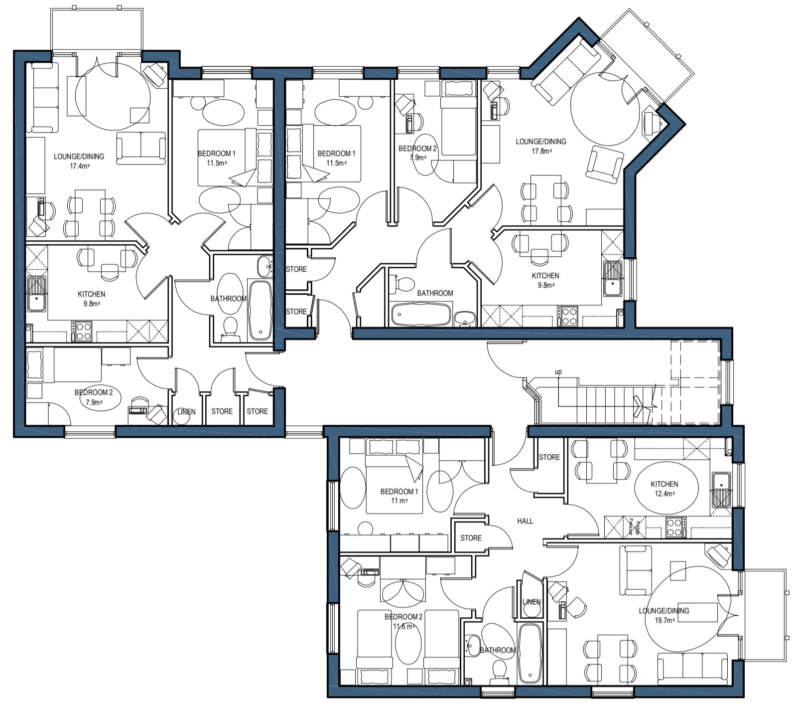
FIRST FLOOR PLANS